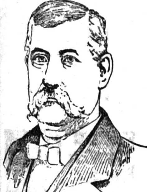
P. WAT HARDIN. [Nominée for Governor.]

PISO'S CURE FOR CONSUMPTION CURES WHERE ALL ELSE FAILS. Best Cough Syrup. Tastes Good. Use in time. Sold by Druggists.